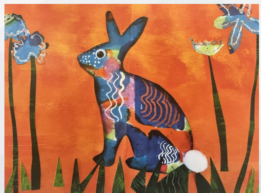
Grade 1/2 Example - Rabbit