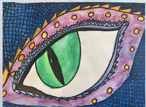
grade 5/6 Example - Dragon Eye