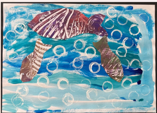
Foundation Example - Fish

Please contact Lisa in the office if you have any questions.