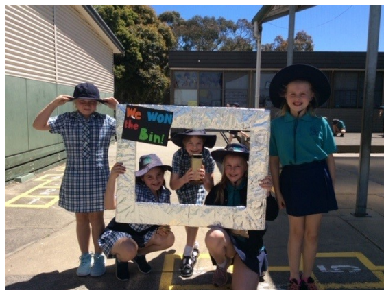
Nude Food winners from October 29 – Grade 2I

In the meantime, please remember that every Tuesday is “Nude Food Day” at CPS. We are asking students to bring their lunch, fruit and snacks wrapper-free and in a reusable container. Less rubbish at school means less rubbish polluting our environment.