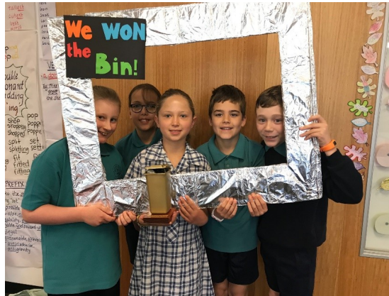
Last Week's Nude Food Winning Grade - 4M

Congratulations to Grade 4M who “Won the Bin” as the Nude Food Champions last week! Fantastic effort 4M!