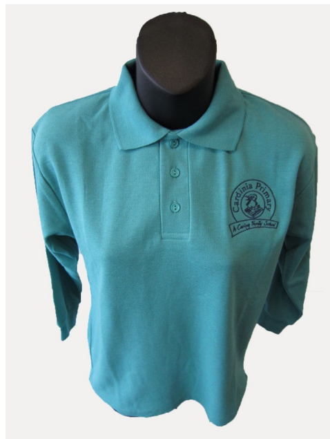
LONG SLEEVE POLO TOP